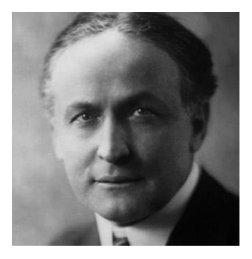
Harry Houdini (b. 1874-d. 1926) Famous escape artist, created many illusions still used today.