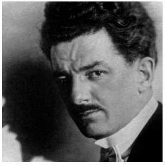
Harry Blackstone (b. 1934-d.1997) Credited with inventing the "saw a person in half" illusion